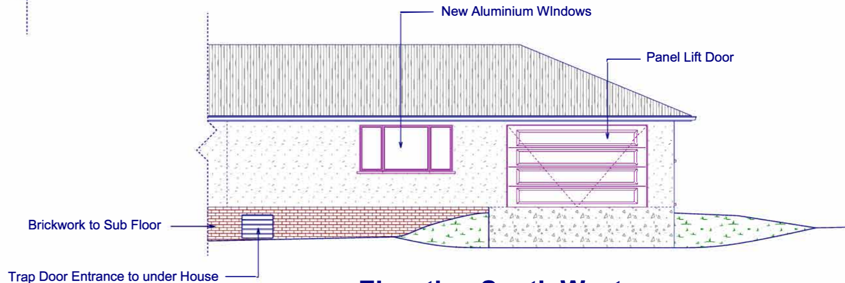
Elevation South West