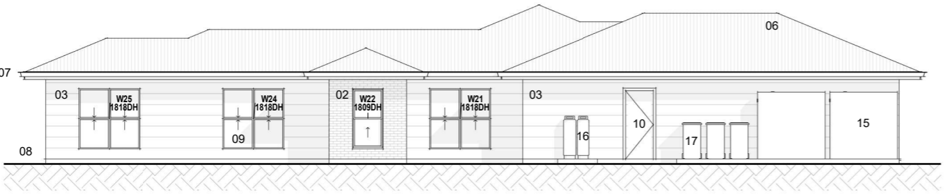
4 WEST ELEVATION 1 : 100