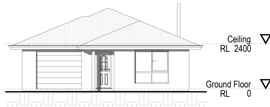
4 South-East Elevation 1 : 100