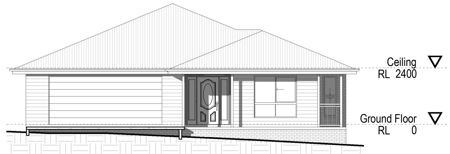
2 South-East Elevation 1 : 100