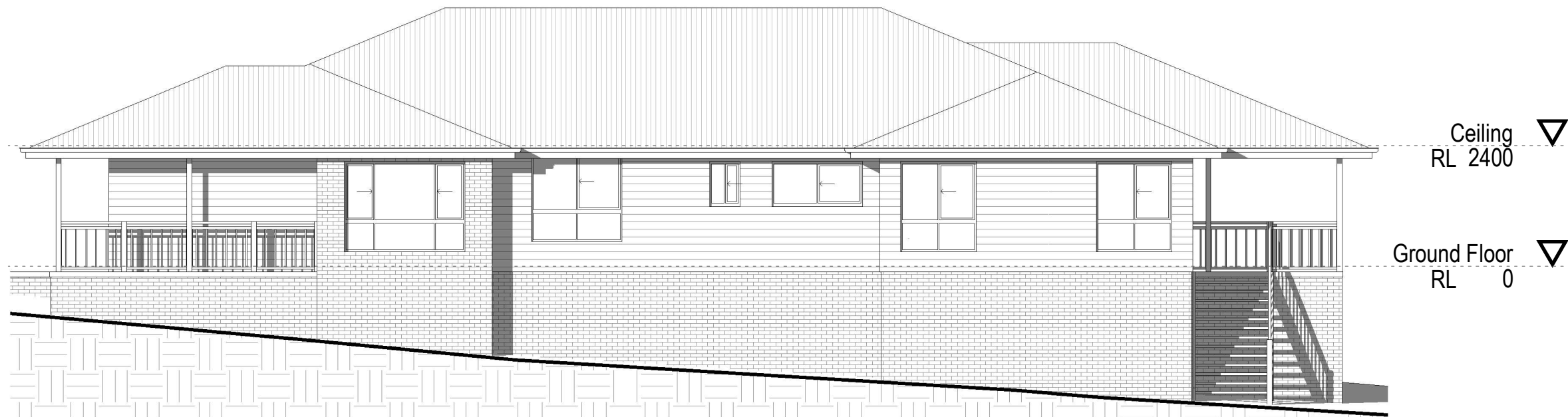
1 North-East Elevation 1 : 100