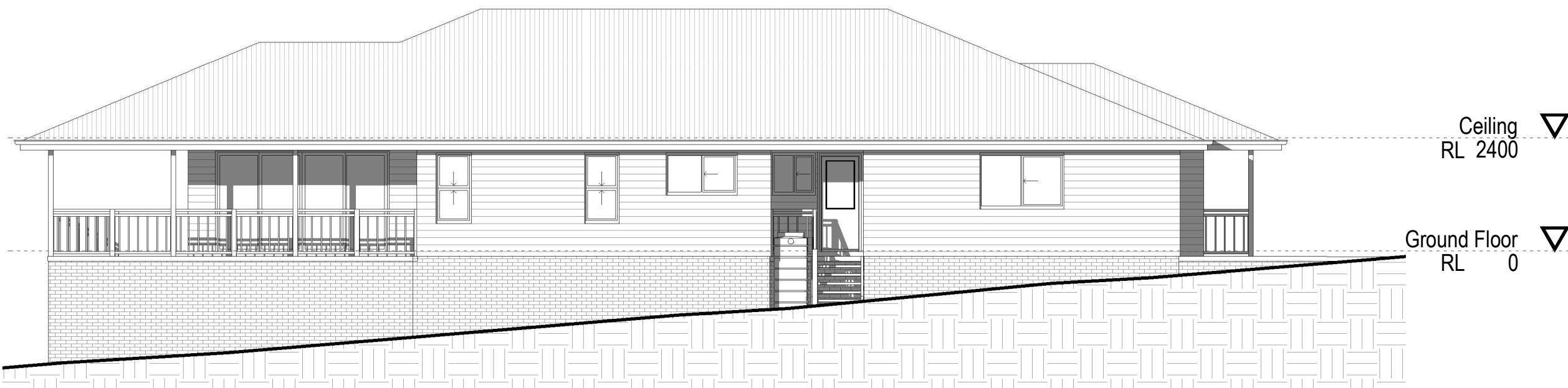
2 South-West Elevation 1 : 100