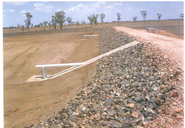
Typical Oxidation Pond Construction (Boggabilla)

The following key activities were undertaken during February 2018: o Further review of Options Study Report final draft