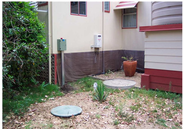
Typical On-Property Pump Installation (Boggabilla)

The following key activities are anticipated during March 2018: o Complete Final Options Study Report o Determine preferred option o Commence initial land acquisition processes o Continue consultation with agencies