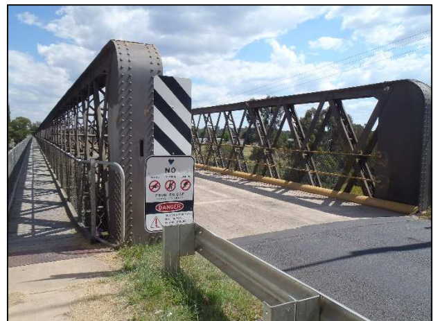
Gwydir River bridge

The following key activities are anticipated during February 2018: o Complete Final Options Study Report o Determine preferred option o Commence initial land acquisition processes o Continue consultation with agencies