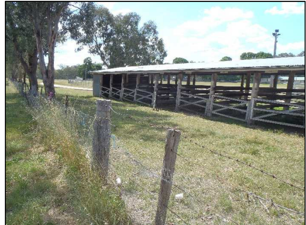
Showground near potential pump station site

The following key activities were undertaken during January 2018: o Finalisation of Options Study Report continuing