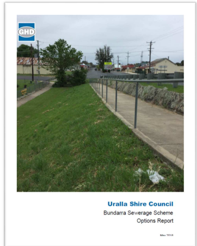
Final Options Report Completed