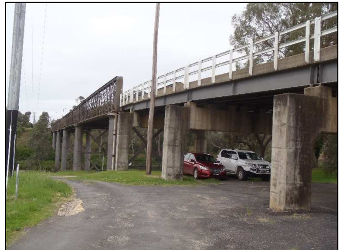
Gwydir River Bridge abutments

Project Value: $5,447,000 RestartNSW Grant Value: $3,675,000 Co-contribution Value: $1,772,000 Total Project Expenditure to Date: $288,938 RestartNSW Total Exp: $193,588 Co-contribution Total Exp: $95,350 Contingency Spent: $0 Contingency Remaining: $710,000