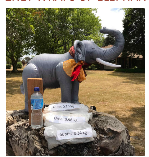
Visit <u>zneturalla.org.au/firewood</u> for more information.

ZNET Uralla recently completed The Elephant in the Woodland, its three-year project to encourage more sustainable firewood use in Uralla Shire.