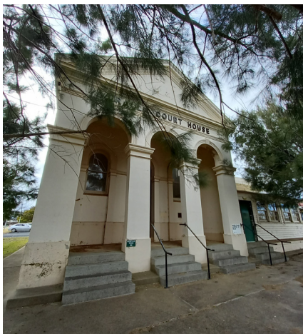
Uralla Court House, cnr of Maitland and Hill Streets, Uralla

$925,000 has been secured through Federal and State funding to restore