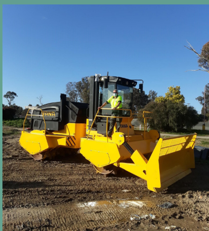
The purchase of a refurbished Compactor Plant will extend the life of the landfill