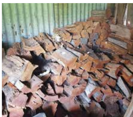
Wood stored in dry shed ready for burning.

Having your flue cleaned every year, checking and replacing door seals and using a smart burner all increase the efficiency of your heater. This also reduces the risk of a fire starting in the flue.