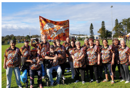
The 2019 Elders Olympics held in Port Macquarie.

The annual Elders Olympics event promotes healthy lifestyles and wellbeing, and provides an opportunity for social engagement and developing ongoing networks.