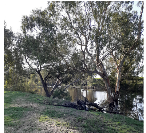
The completion of the Bundarra Sewerage Scheme will provide environmental health benefits for the Gwydir River.

I'm also looking forward to celebrating Australia Day 2021 in Uralla and welcoming four new Australian citizens in our Shire. While Australia Day celebrations this year will look a little different to maintain COVID Safe guidelines, the importance of this day to reflect, respect and celebrate what it means to be an Australian hasn't changed.