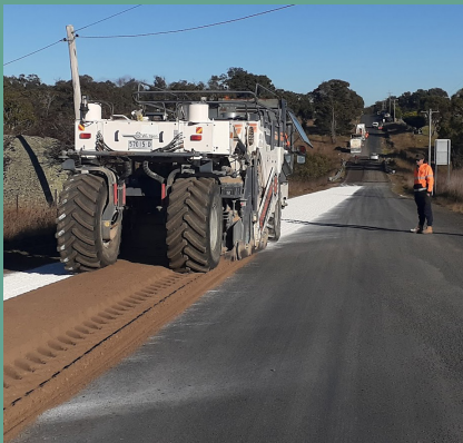
Stabilising Bundarra Road