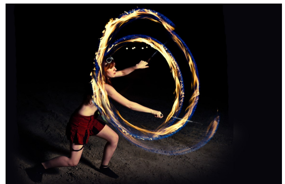
The art of Poi Spinning

The Uralla Lantern Parade is made possible by Phoenix Foundry, Uralla Shire Council and many local businesses and individuals.