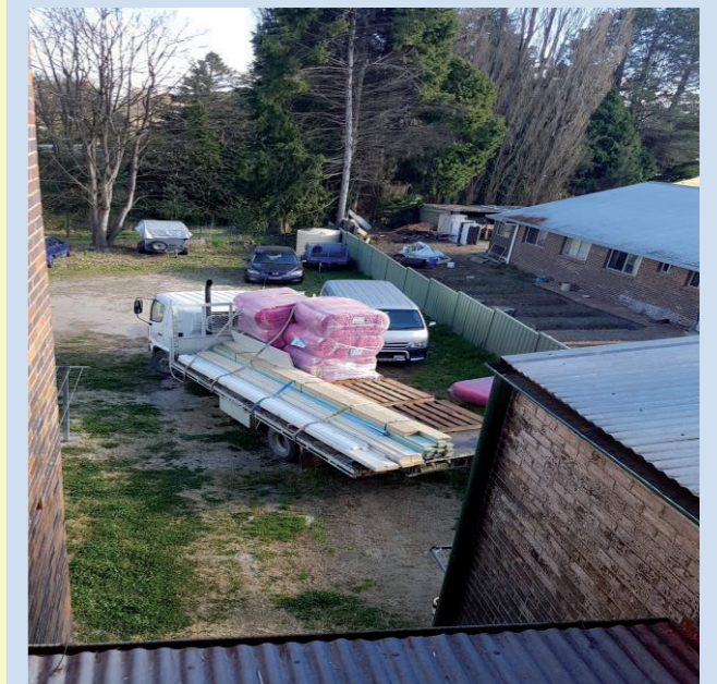
Photo: Delivery of the insulation.

Poke your head up into the ceiling with a torch and check out yours.