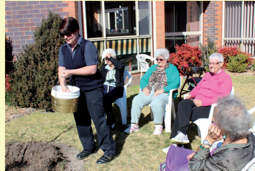
PHOTO: Staff planting a tree while the resident's look on.

The residents and staff of McMaugh's came together in August to celebrate World Friendship Day. What better way to celebrate than by planting a tree particularly as it was National Plant a Tree day as well. The morning was spent reciting poems and talking about friendships new and old. A small group gathered outside and helped plant a beautiful weeping maple tree. Once the tree was planted and given a small blessing the group celebrated friendship over a warm coffee.