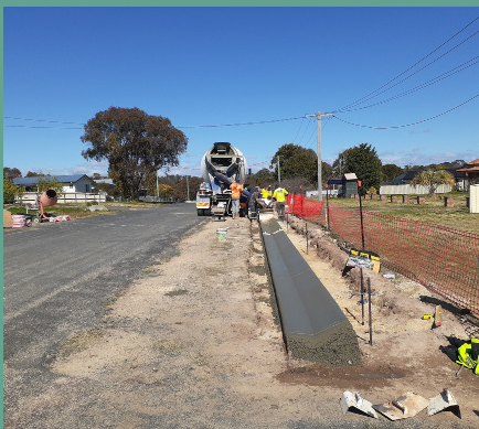
Kerb and gutter works underway at Roman Street, Uralla