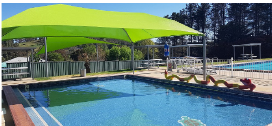
The Uralla Swimming Pool will open for the 2022-2023 season on Saturday, 22 October 2022.

While it has been a wet spring and there's more rain on the forecast, it's important to be ready now for the summer bushfire period. The Bush Fire Danger Period (BFDP) for the New England region commenced 1 September. During the BFDP, landowners and land