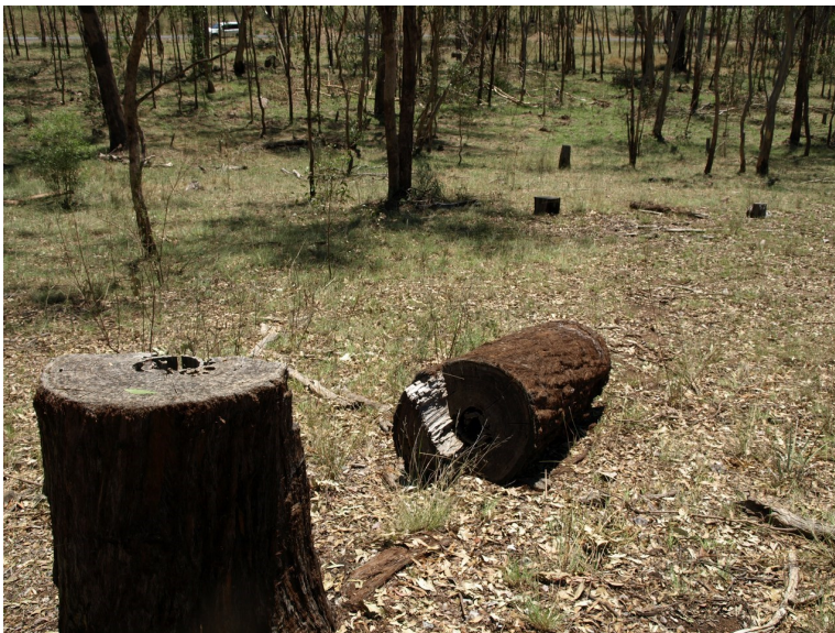
Residents are advised that the removal of timber from any public land (Travelling Stock Routes, Crown Reserves, road sides) is illegal. The Office of Environment, Northern Tablelands Local Lands Services & Council have powers to apply fines to people caught taking timber from public lands.

What you can do to help reduce the environmental impact: Ask your supplier for sustainably managed firewood. If you have friends or family who farm, ask if you can collect any unwanted wood they plan to burn in the paddock. If you own land that you collect wood from, plant native trees to replace those that you remove. When you collect wood, avoid collecting wood from along creek lines; avoid dead trees with lots of hollows; & leave a good cover of coarse woody material on the ground in an area you are removing wood from.