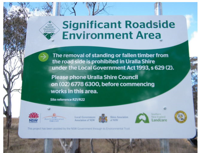
High Conservation Value sites have been marked with signs similar to this one. Watch out for them on your next trip around the Shire.