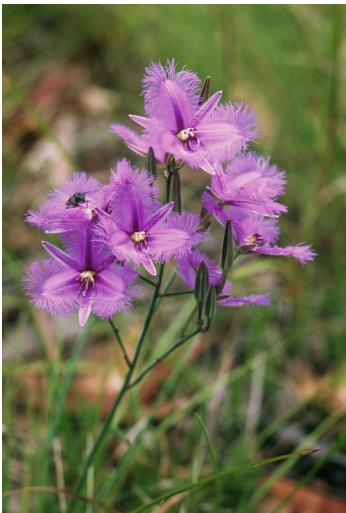
Above: Fringed lilies are found along Bundarra-Barraba Road & Lindon Road.

Council wishes to acknowledge the support and contribution of the Northern Tablelands Local Lands Services to our current phase of roadside management practice.