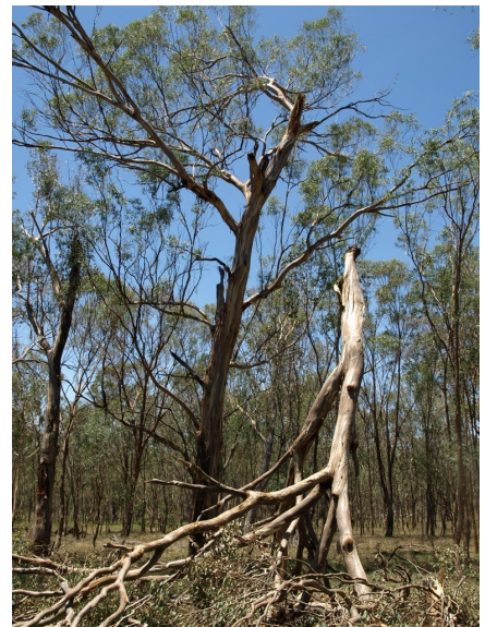
Coarse woody debris is essential habitat for insects that support the food web in woodland ecosystems. When broken down dead timber adds essential nutrients to the system, which supports regrowth of the woodland.