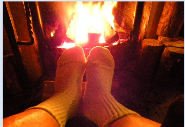
Photo: Wood is an important energy resource for the Uralla Shire, we just need to make sure its use is renewable and that enough is left in the environment for wildlife habitat, nutrient cycling and reducing soil erosion.

The next exciting step will be to put high-tech internet-connected sensors in case study homes to see what is happening minute by minute with firewood and electricity use.