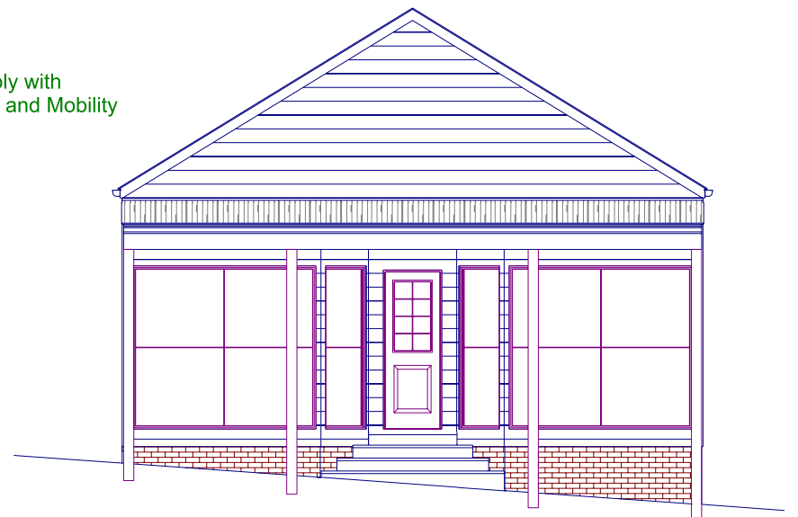
NW ELEVATION SCALE: 1:100