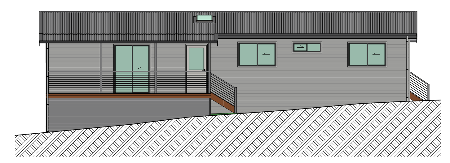
E-03 \frac{\text{south elevation}}{1:100}