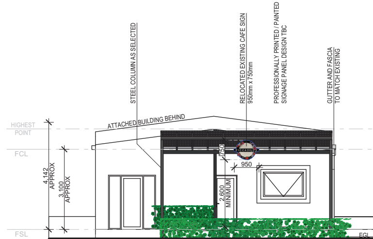
SOUTH WESTERN ELEVATION SCALE 1:100@A3