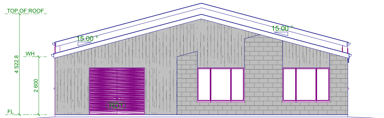
NORTH ELEVATION SCALE: 1:100