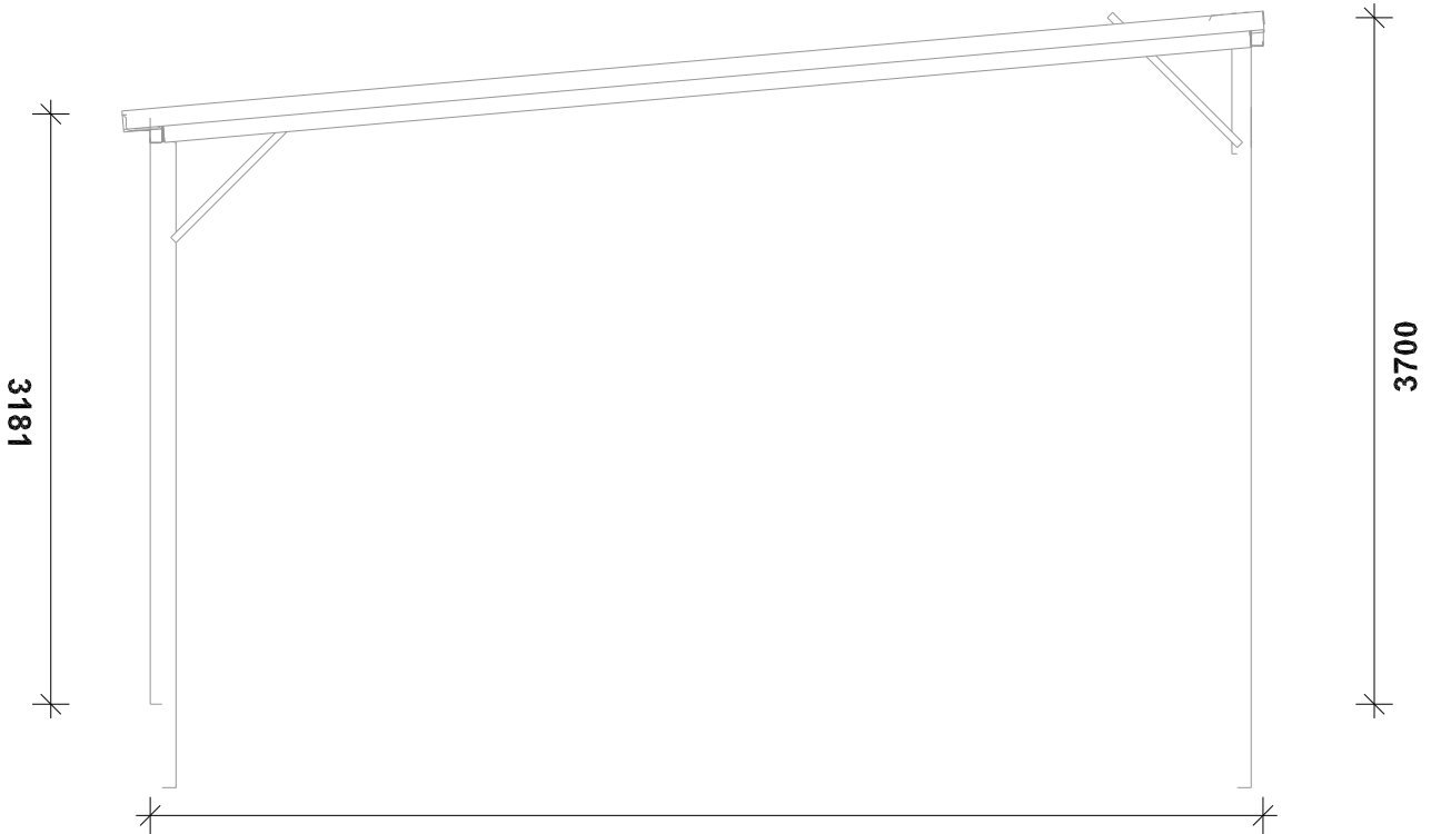
Scale 1 : 38