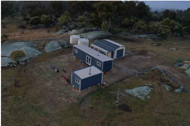
buildings onsite (image provided)