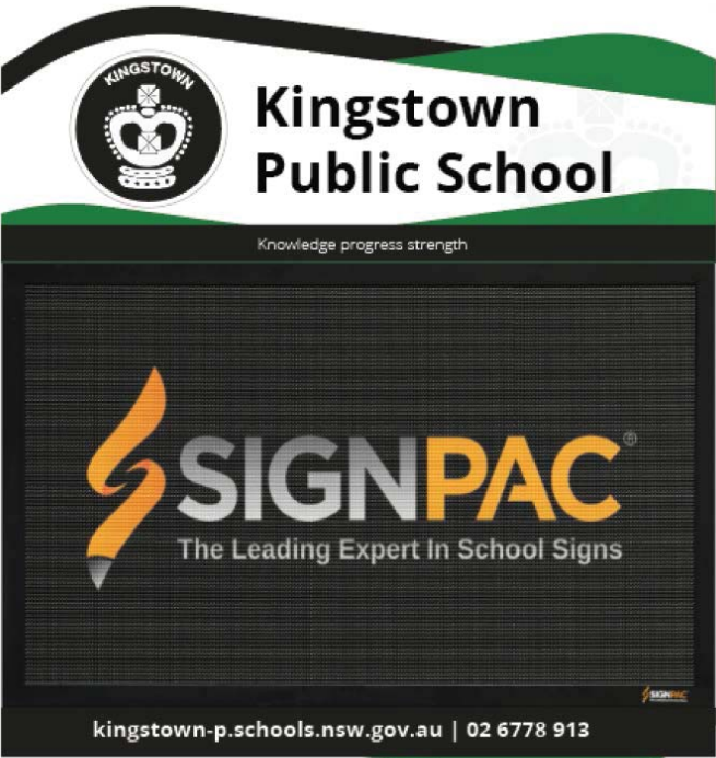
SIGNAGE DESIGN ARTISTIC DESIGN - SHOWN FOR VISUAL REPRESENTATION PURPOSES OF THE SIGNAGE ELEMENTS ONLY

SITE INVESTIGATION - A COMPLETE INVESTIGATION OF SERVICES HAS NOT BEEN UNDERTAKEN FOR THIS SITE PLAN. - CONFIRMATION OF CRITICAL POSITIONS SHOULD BE OBTAINED WITH ON SITE DETECTION SERVICES. - THIS PLAN SHOULD NOT BE USED FOR CRITICAL DESIGN DIMENSIONS IN RELATION TO EXISTING STRUCTURES AND SERVICES. - PRIOR TO ANY DEMOLITION, EXCAVATION OR CONSTRUCTION ON THE SITE, AUTHORITIES SHOULD BE CONTACTED FOR LOCATION OF ALL SERVICES. - NEGLECTING TO DIAL 1100 BEFORE DIGGING OR EXCAVATING CAN LEAD TO COSTLY DISRUPTION TO ESSENTIAL SERVICES, AND INJURY OR DEATH TO WORKERS AND THE GENERAL PUBLIC. IT CAN ALSO LEAD TO HEAVY FINANCIAL PENALTIES.