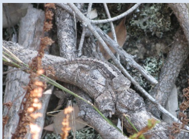
Can you spot the lizard making its home in the dead wood?

We live in a beautiful part of the world (even if it is a bit dry at the moment). A big contributor to this is our woodlands and wildlife. Uralla has a number of public reserves that have a high conservation value providing really important habitat for birds, plants, lizards and insects.