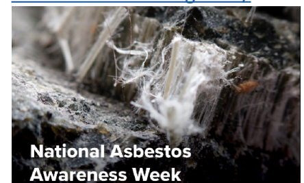
National Asbestos Awareness Week

The National Asbestos Awareness Campaign will also be running throughout November to remind homeowners and tradies across Australia to Think Twice about Asbestos. Find out more at Asbestos NSW: www.asbestos.nsw.gov.au/