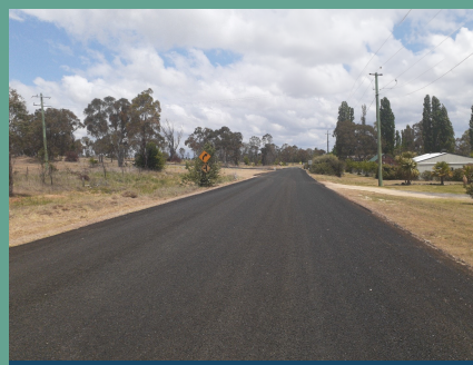
Barleyfields Road intersection with Warwick Street, Uralla – pavement rehabilitated and resealed throughout.