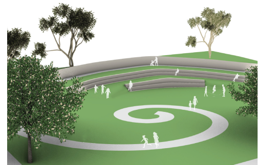
3D Renders of Fibonacci theme at Rotary Park

The Glen - the project includes seven sculpture artworks circled around a central spire. The park will also have an asphalt road and carpark, as well as two culvert creek crossings to enhance accessibility. A new wheelchair friendly BBQ and park furniture and an upgrade of the information shelter is also planned.