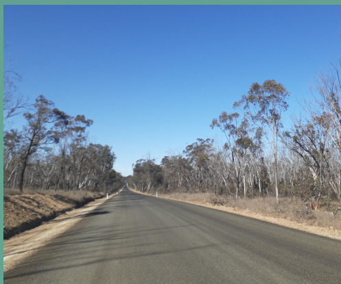
1.8km new seal on Thunderbolts Way at Two Mile Creek at Abington