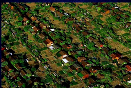
This is called "Foodscaping." Each yard has a vegetable garden with fruit trees. Neighbors consult with each other so they can trade the food that is grown. Imagine if people did this everywhere?

This spring and summer forecast is for a hot and dry season and with all the extreme weather events happening globally, FOOD SECURITY is an increasing concern. One way we can mitigate those $13 lettuce events is to simply grow a little more in our own gardens and share with our neighbours or bring along to the ZNET market stall to swap or sell. FOODSCAPING our gardens helps to lower our cost of living, gives a little more peace of mind, and, it's fun.