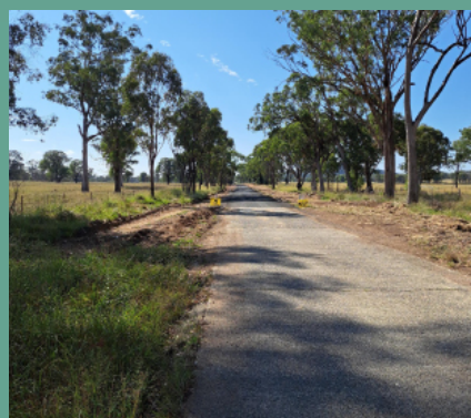
Kingstown Road Works