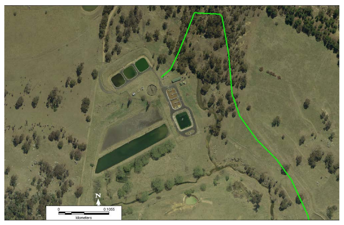
Figure 3.1 Aerial photograph of Uralla Sewerage Treatment Plant, Mt Chocolate Road. Sewerage rising main location is shown by green line.

Uralla Shire Council operates the Uralla Sewage Treatment Plant located at Mt Chocolate Road and holds Licence Number 1626 from EPA for the premises.