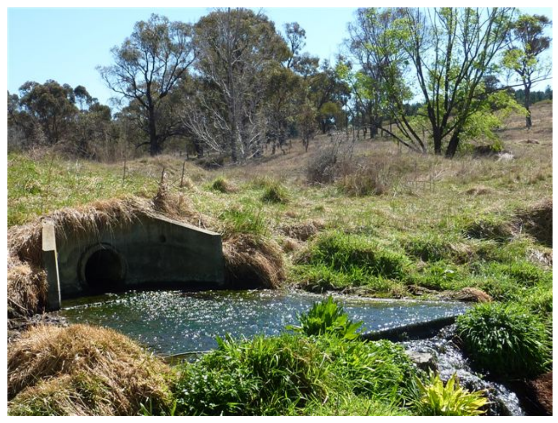
Figure 3.3 Outflow from plant into Chinamans Gully.