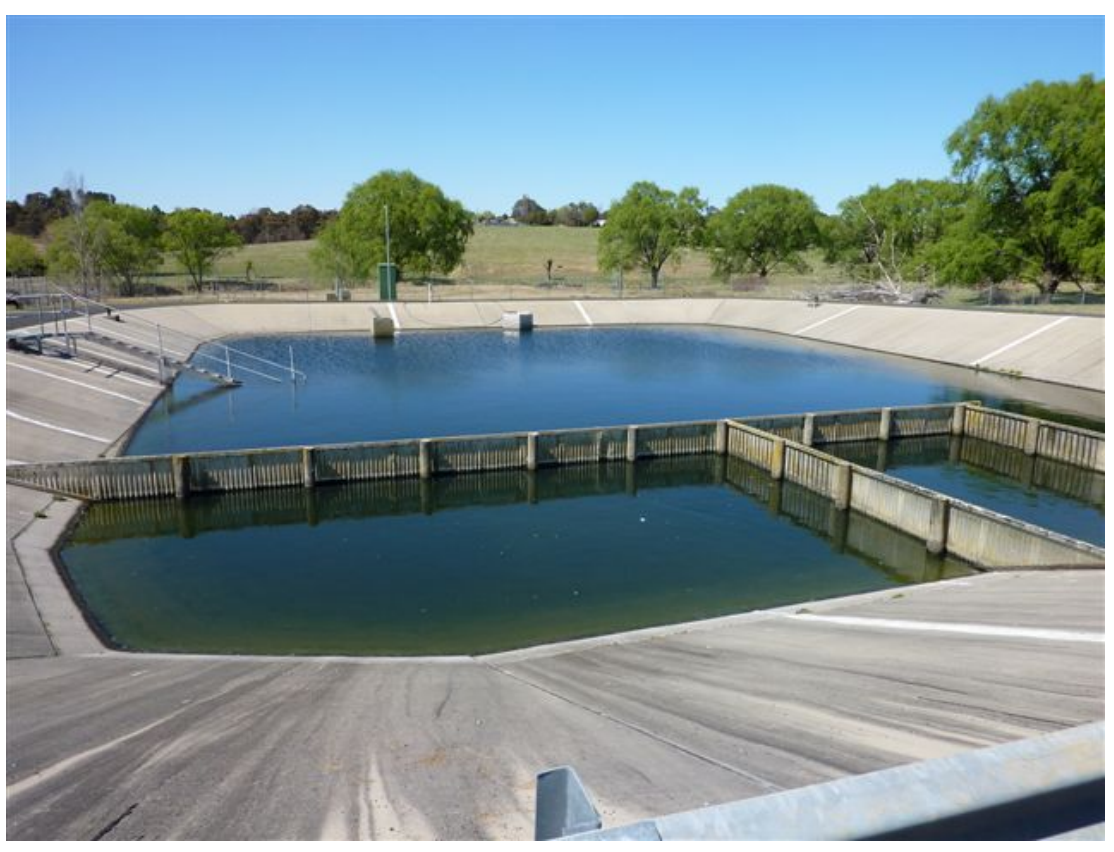
Figure 3.2 Catch Balance Tank.