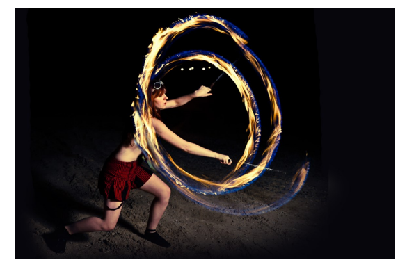
The art of Poi Spinning

8:00pm (approx) Finale performance featuring Dirt Girl, the Gnome, the Busy Bee, and the amazing ZURG!