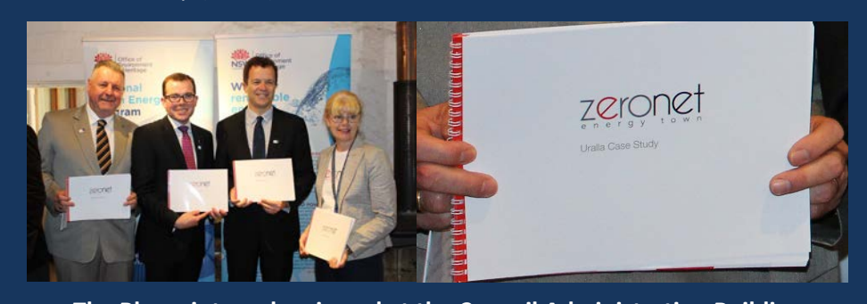
The Blueprint can be viewed at the Council Administration Building or on the Council website.

The Mayor would once again like to thank all the community members who got behind the ZNET project, particularly the members of the ZNET Uralla Reference Group (ZURG).