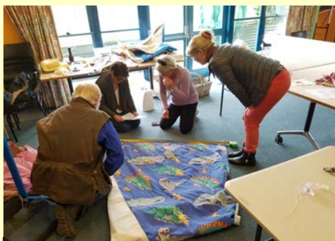
PHOTO: Z-NET Uralla curtain makers following instructions on how to measure out where the curtain eyelets will go.

The free Curtain Workshop is designed especially for those who rent as this is one great action renters can take – putting up a window blanket, curtain or bubble wrap. At the Workshop Z-NET is providing FREE thermal lining for your curtains.