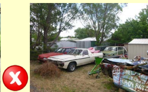
Unused wrecks and Long grass create habitats for vermin and Snakes