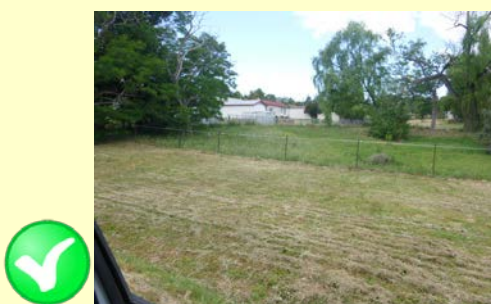
Lawns kept well maintained don't provide safe harbourage of snakes and vermin

Council's Officers will also be reviewing properties in our Shire for long grass and waste compliance during these warmer months.