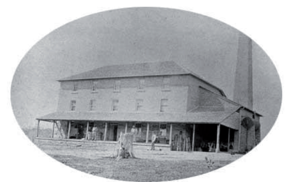
McCrossin's Mill c.1872

Small streets ran at right angles to join the tree-lined highway to Armidale. The New England Highway was originally known as the Great Northern Road and it followed Queen Street.