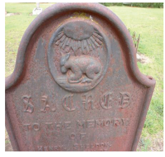
FIGURE 1: Lamb – Symbol of childhood/infancy

There is a close relationship between the design of gravestones and the architectural style of the time. Early headstones are simple with little decoration and this can be seen in the Norman upright shape and the anthropomorphic design, where there is a representation of the head and shoulders of a human figure. Obelisks and columns are seen in this cemetery with one broken to symbolize a shortened life. A number of Greek cinerary urns sometimes shrouded or garlanded are evident demonstrating classical features of style. Above all, the skills of the stonemason are evident as they carved the stone to suit the taste of the grieving families.