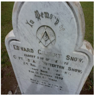
FIGURE 2: Masonic Symbols – Indicative of tradesmen